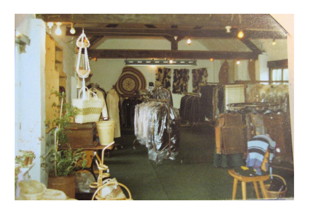
Inside The Barn Shop

The Roberts gutted the poultry barn and turned it into a shop. They also planted a Christmas tree in the front lawn. The Barn Shop sold mainly sheepskin coats.