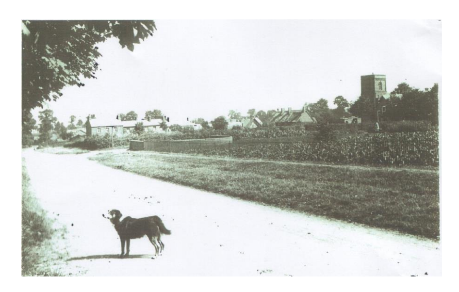
A photograph showing the surrounding wall of Lees Pit in the 1920s BLHG P02/015

At this time, on the far side of Daventry Road from the farmhouse, there was a traditional watering hole for livestock, probably used by farmers driving their stock on foot to market in Rugby. It became known as Lees Pit. By the 1950s, it had become a dumping ground for rubbish and it was filled in. Following a bequest from Audrey Pittom, the Parish Council installed a bench and mounted a plaque on the wall.